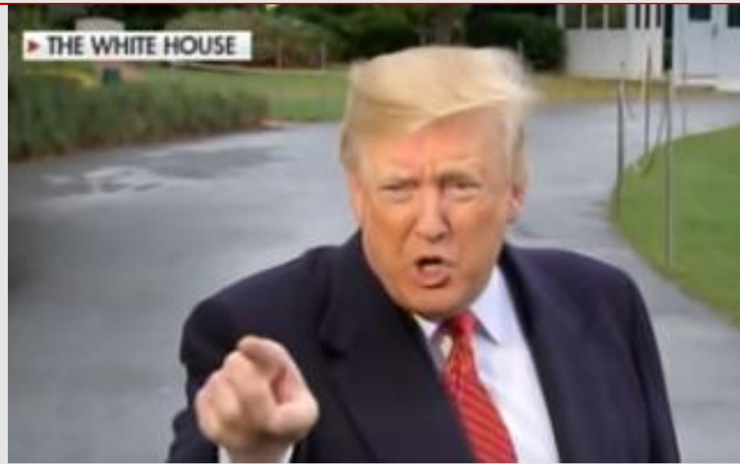
TRUMP WARNS OBAMA Something Big Is About to Drop: "I'll Never Forgive Him..." For Something That Is About to Be Revealed (Video)

.....starts with one person, one relationship, one family, one neighbor, one neighborhood, one village, one community, one city, one state, one nation, at a time... simultaneously.