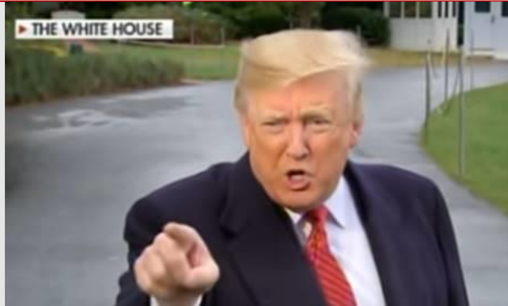
TRUMP WARNS OBAMA Something Big Is About to Drop: "I'll Never Forgive Him..." For Something That Is About to Be Revealed (Video)

.....starts with one person, one relationship, one family, one neighbor, one neighborhood, one village, one community, one city, one state, one nation, at a time...simultaneously.