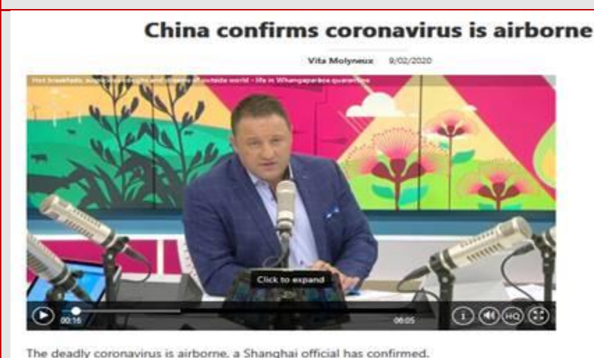
The deadly coronavirus is airborne, a Shanghai official has confirmed.

.....starts with one person, one relationship, one family, one neighbor, one neighborhood, one village, one community, one city, one state, one nation , at a time...simultaneously.