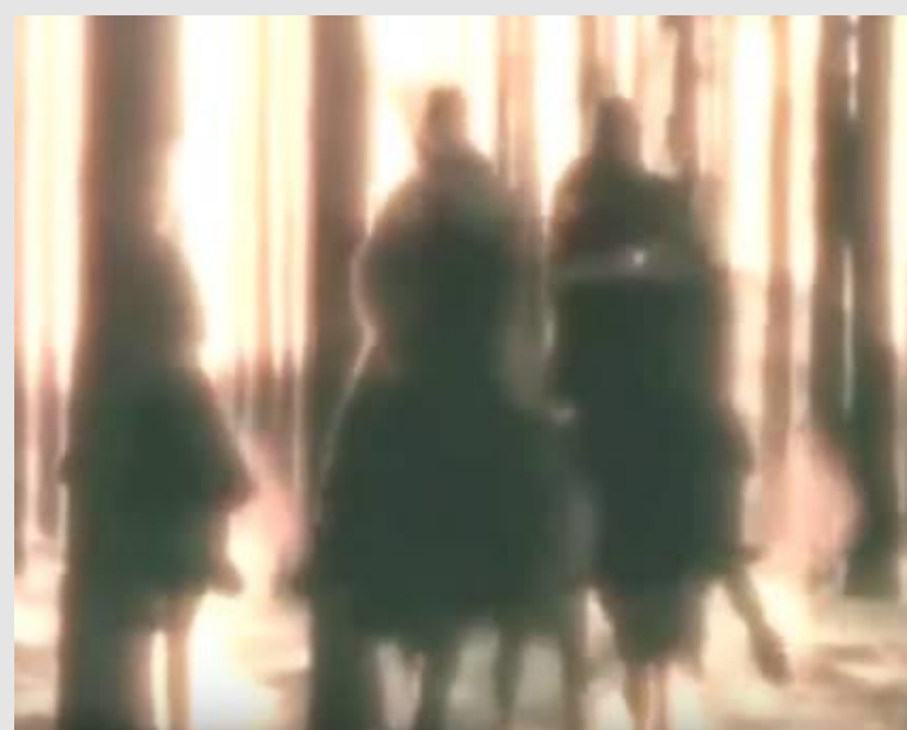
Sent from the New Republic. playlist.