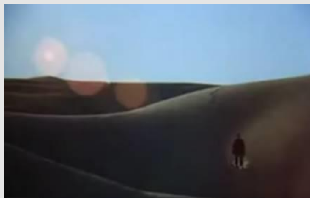
SYNCHRONICITY and ELECTRIC UNIVERSE .