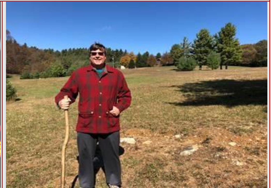
CONSTITUTIONALISM....is the new counterculture.