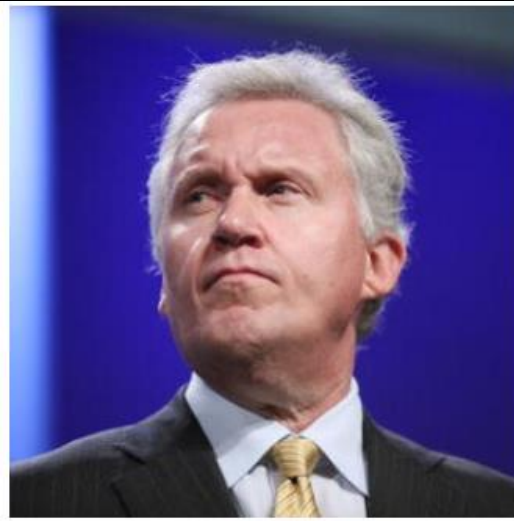
Jeffrey Immelt, 65, former CEO of General Electric, with a net worth of $150 million, enjoyed destroying the majority of GE's middle class American labor force, along with overseeing the reduction of General Electric's market capitalization by 85%.