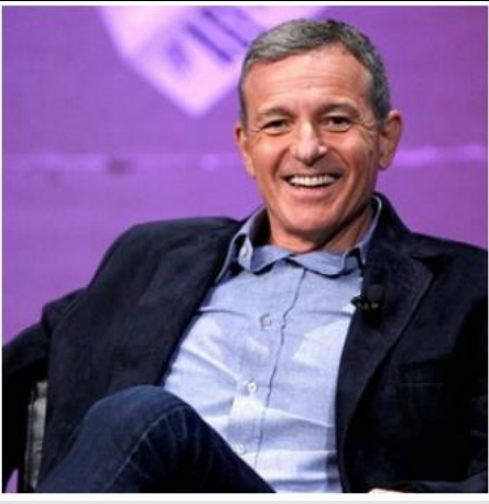
Bob Iger, 70, former CEO of Disney, with a net worth of $350 million, enjoyed leading the layoffs of middle-class American citizens in favor of H1B sponsored labor, then forcing the layoffs to train their replacements, or face punitive damages.