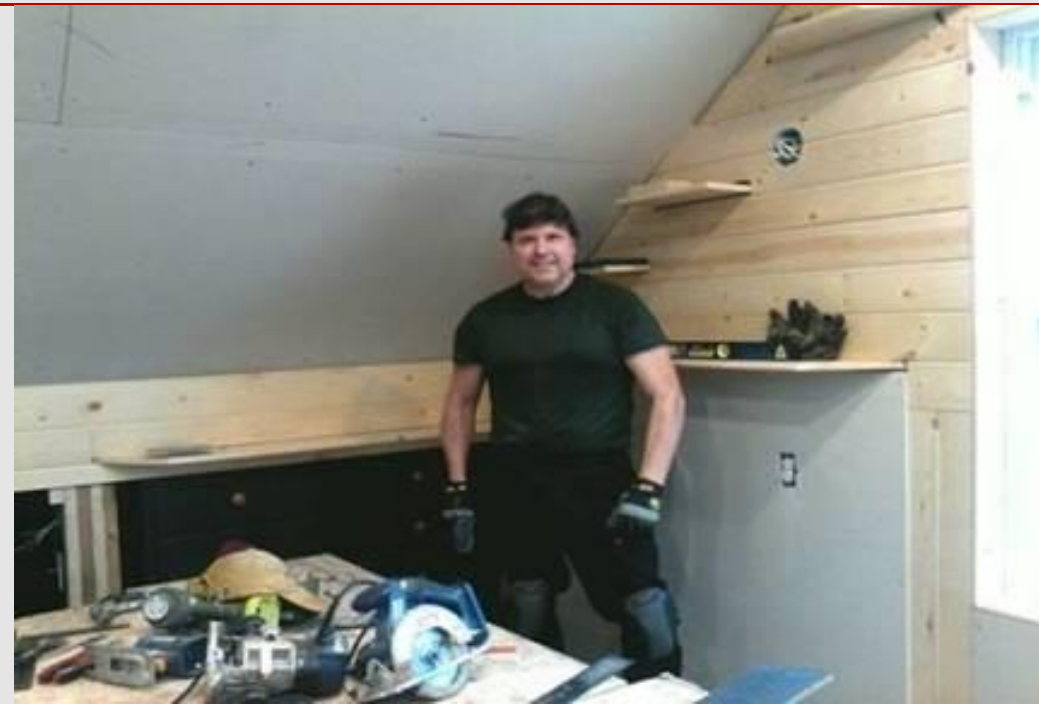
Sent from the New Republic. playlist.