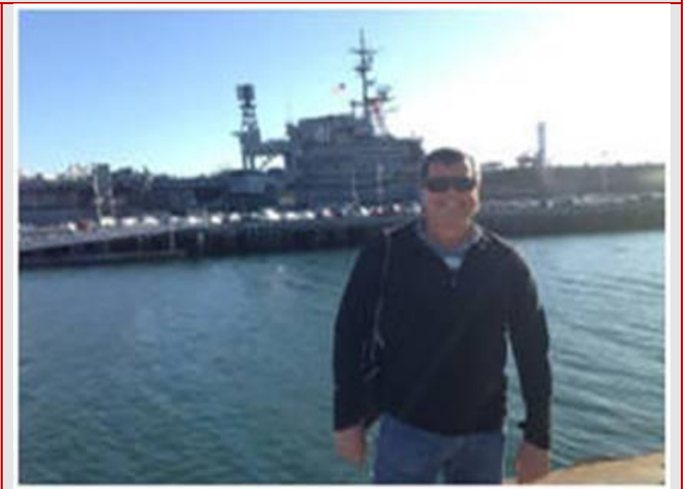
CONSTITUTIONALISM....is the new counterculture.