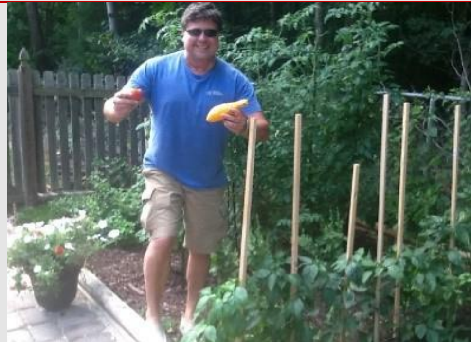
SYNCHRONICITY and ELECTRIC UNIVERSE.

.....starts with one person, one relationship, one family, one neighbor, one neighborhood, one village, one community, one city, one state, one nation, at a time....simultaneously.