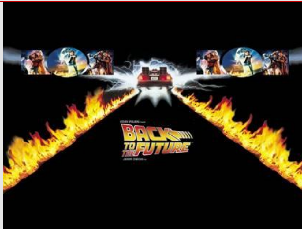
Sent from the New Republic. playlist.