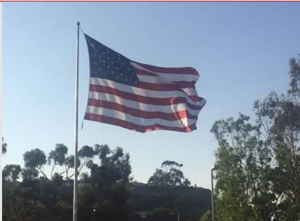
SYNCHRONICITY and ELECTRIC UNIVERSE .

.....starts with one person, one relationship, one family, one neighbor, one neighborhood, one village, one community, one city, one state, one nation, at a time...simultaneously.