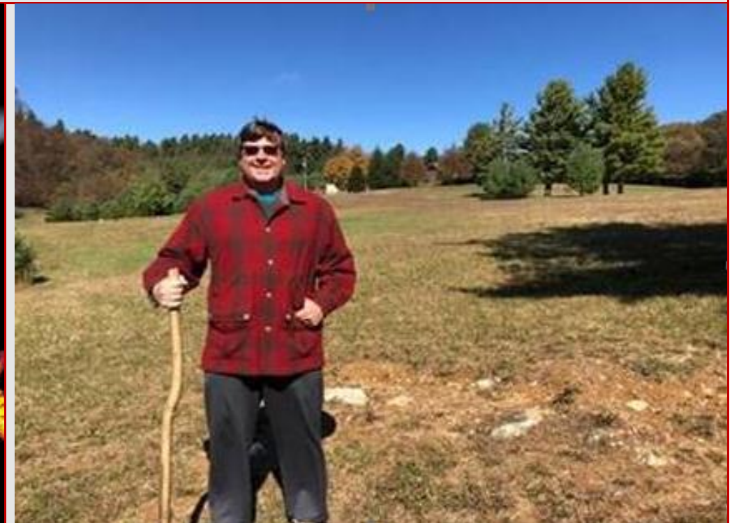
CONSTITUTIONALISM.....is the new counterculture.