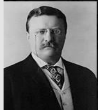
Theodore Roosevelt 26th U.S. President (1858-1919)

Behind the ostensible government sits enthroned an invisible government owing no allegiance and acknowledging no responsibility to the people.