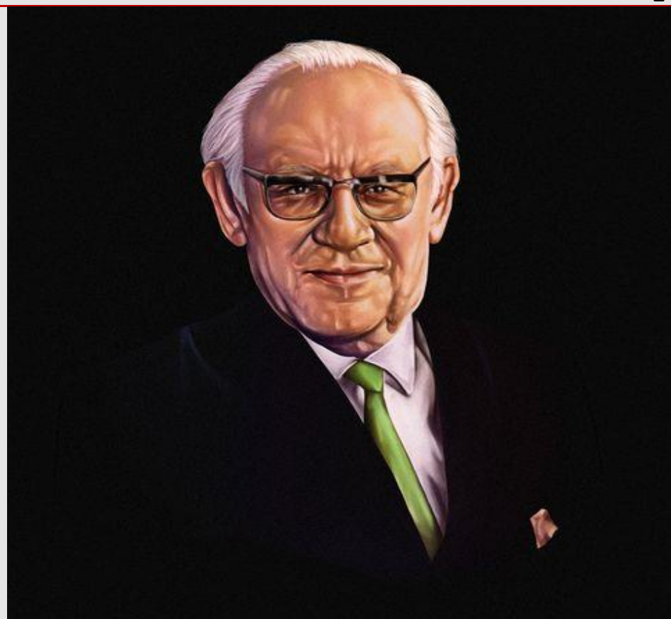
Arthur Sackler, the family's patriarch.

.....starts with one person, one relationship, one family, one neighbor, one neighborhood, one village, one community, one city, one state, one nation, at a time...simultaneously.