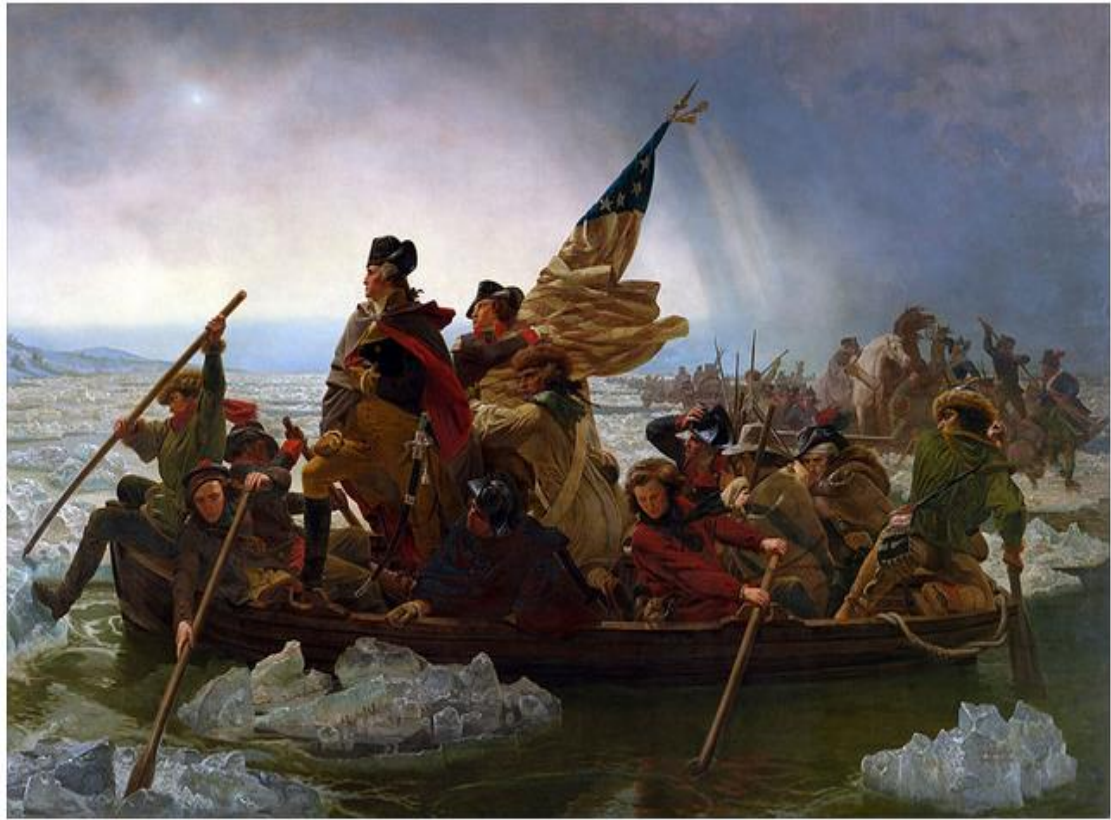
Home > Analysis > The Hi-Tech Traditionalist: Is America's Military Loyal To Its Commander In Chief?

.....starts with one person, one relationship, one family, one neighbor, one neighborhood, one village, one community, one city, one state, one nation, at a time...simultaneously.