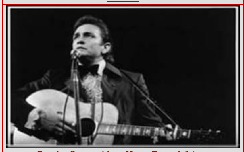
Sent from the New Republic. playlist.

.....starts with one person, one relationship, one family, one neighbor, one neighborhood, one village, one community, one city, one state, one nation, at a time....simultaneously.