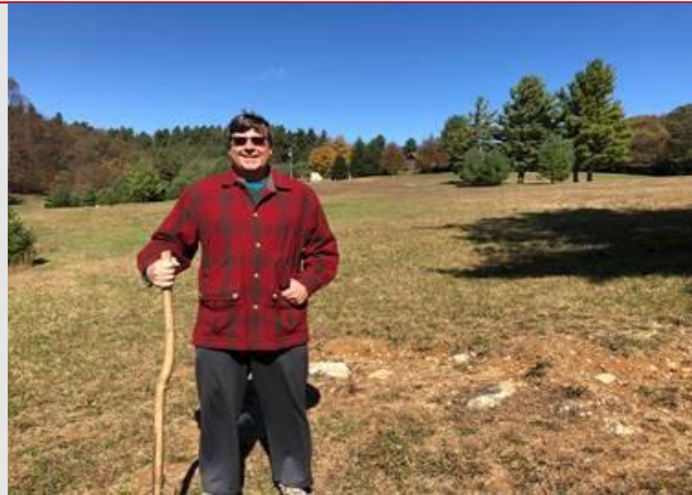
SYNCHRONICITY and ELECTRIC UNIVERSE.

.....starts with one person, one relationship, one family, one neighbor, one neighborhood, one village, one community, one city, one state, one nation, at a time...simultaneously.