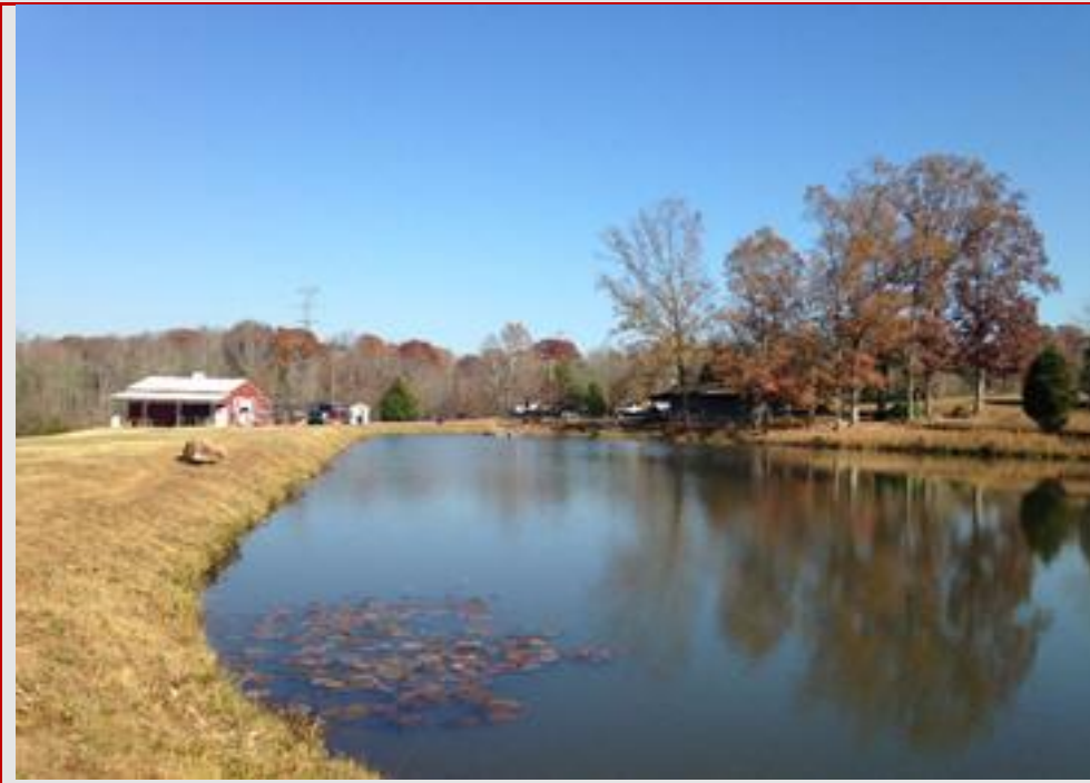
Sent from the New Republic.