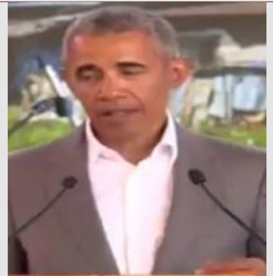
CONSTITUTIONALISM....is the new counterculture.