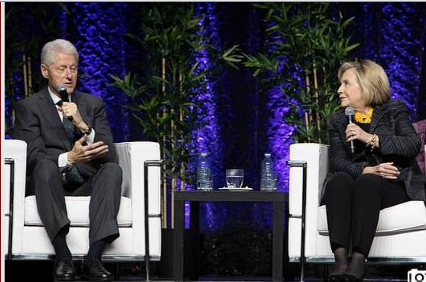
Sent from the New Republic. playlist.