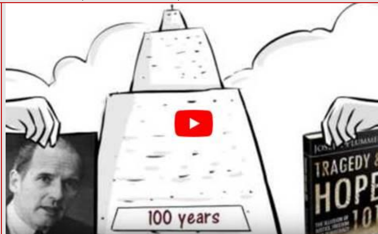
Sent from the New Republic.