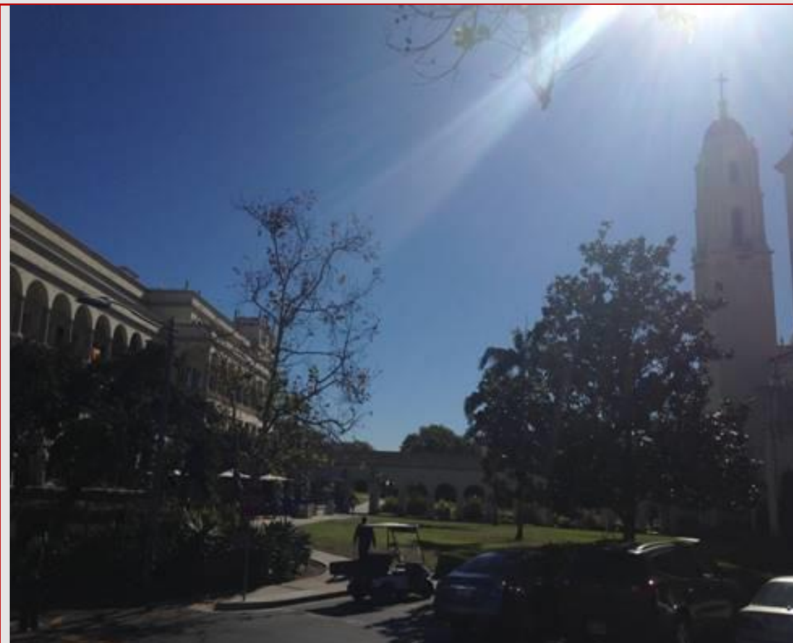
Sent from the New Republic.