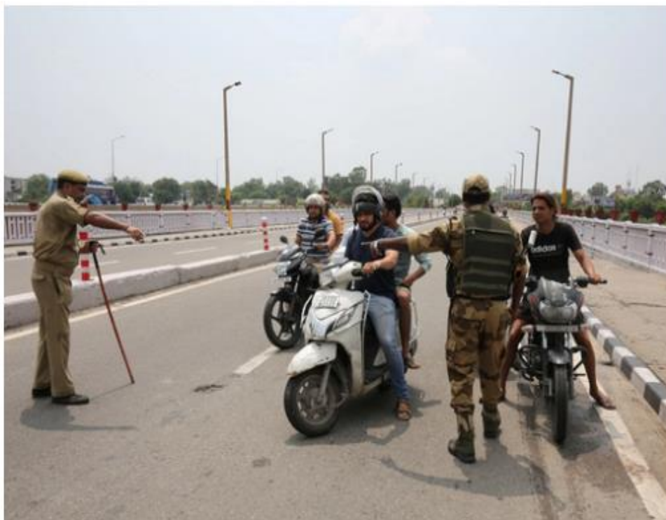
A police checkpoint on Monday in Jammu and Kashmir, a disputed mountainous region along the India-Pakistan border.