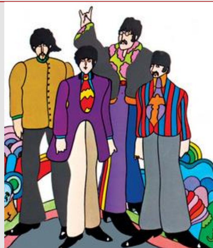
SYNCHRONICITY and ELECTRIC UNIVERSE.

.....starts with one person, one relationship, one family, one neighbor, one neighborhood, one village, one community, one city, one state, one nation, at a time...simultaneously.