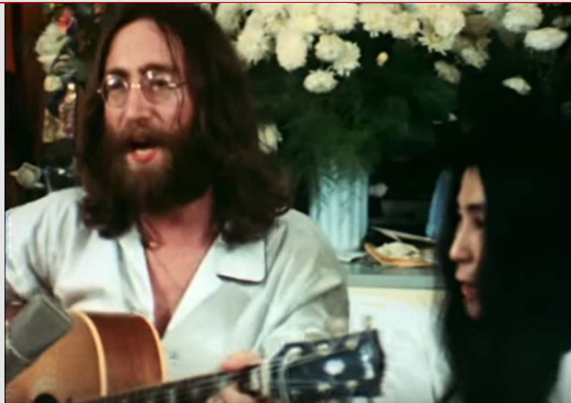
Sent from the New Republic.