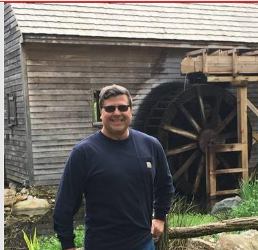
Sent from the New Republic. playlist.