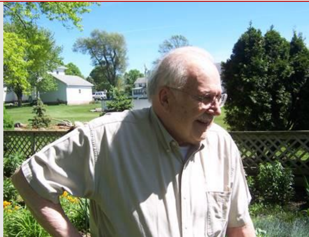
Sent from the New Republic. playlist.