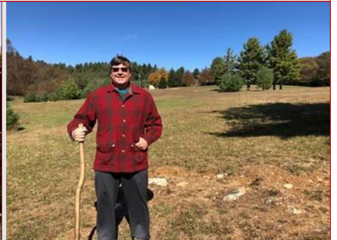
CONSTITUTIONALISM....is the new counterculture.