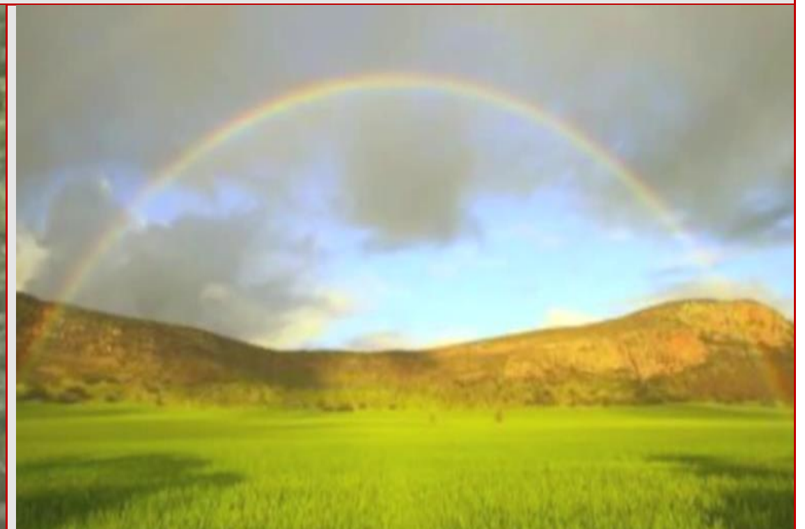
CONSTITUTIONALISM.....is the new counterculture.