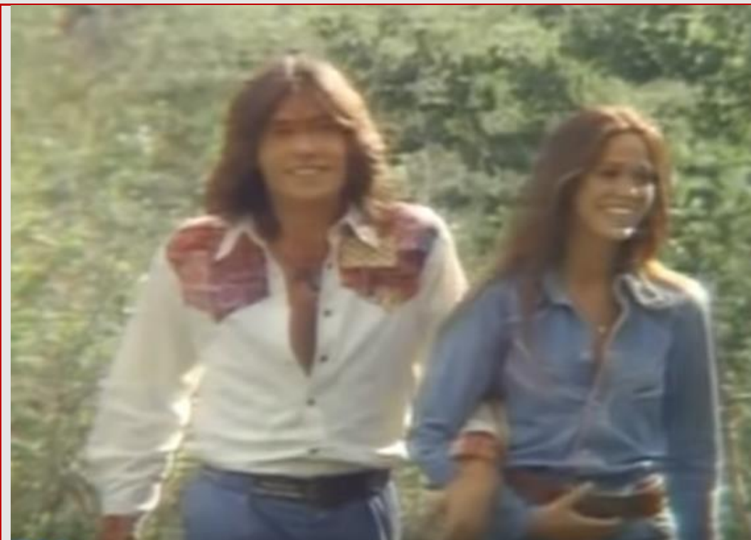
Sent from the New Republic. playlist.