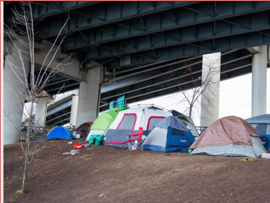
52,765 individuals and family members experiencing homelessness, less than 30 minutes away.