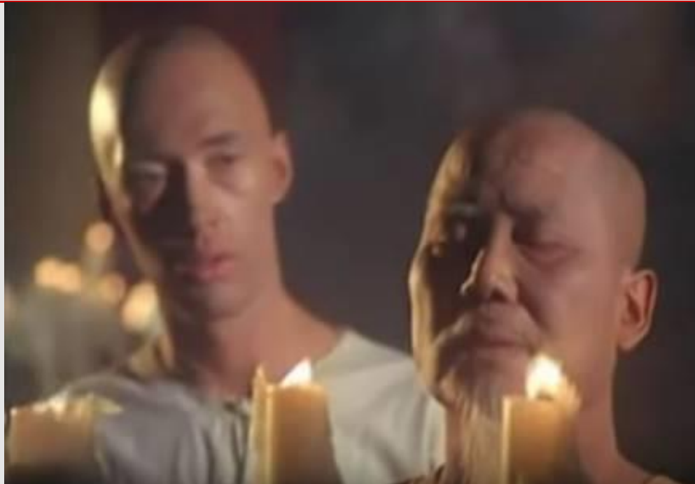
SYNCHRONICITY and ELECTRIC UNIVERSE.

.....starts with one person, one relationship, one family, one neighbor, one neighborhood, one village, one community, one city, one state, one nation, at a time....simultaneously.