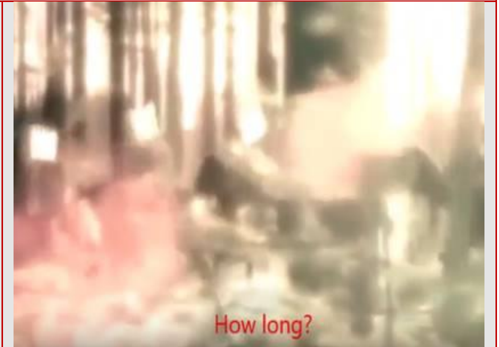
CONSTITUTIONALISM....is the new counterculture!