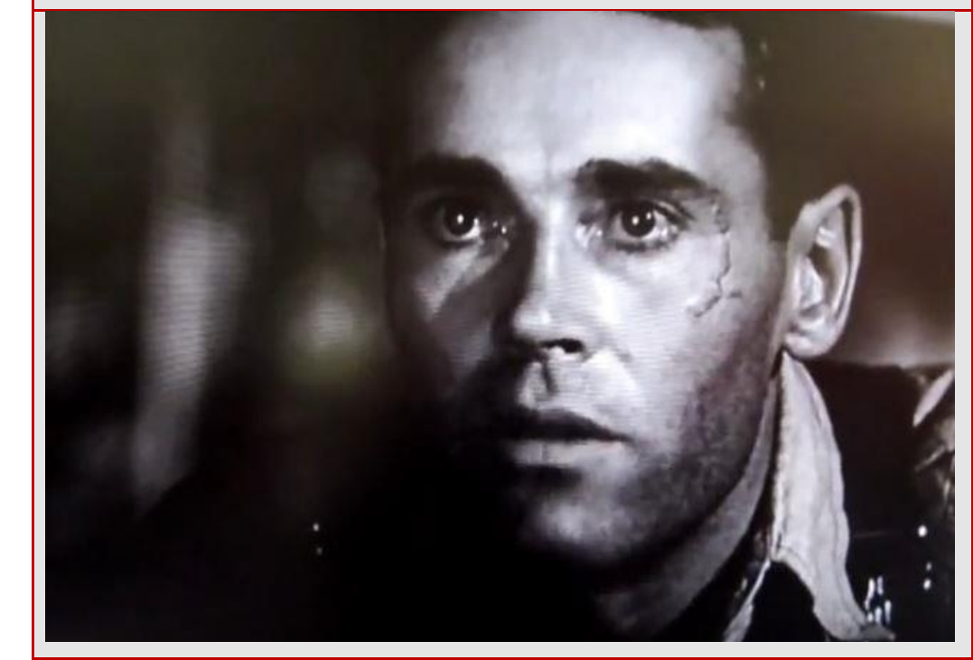
Sent from the New Republic.