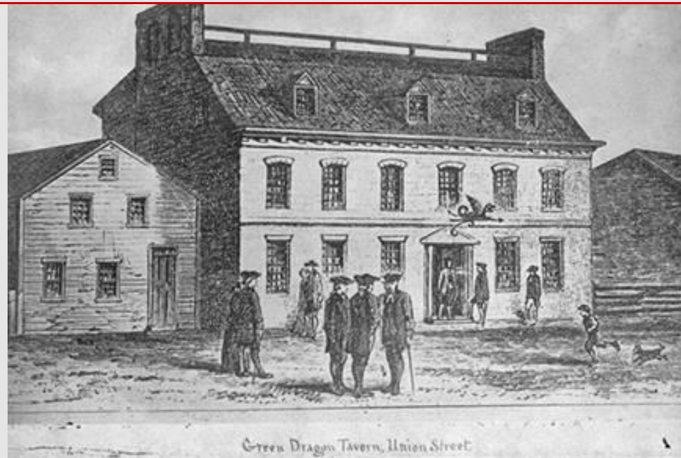
Green Dragon Tavern, Union Street

.....starts with one person, one relationship, one family, one neighbor, one neighborhood, one village, one community, one city, one state, one nation , at a time...simultaneously.