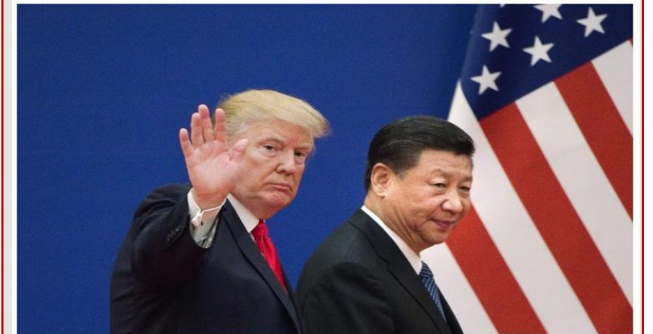
U.S. President Donald Trump (L) and Chinese leader Xi Jinping leave a business leaders event at the Great Hall of the People in Beijing on November 9, 2017.