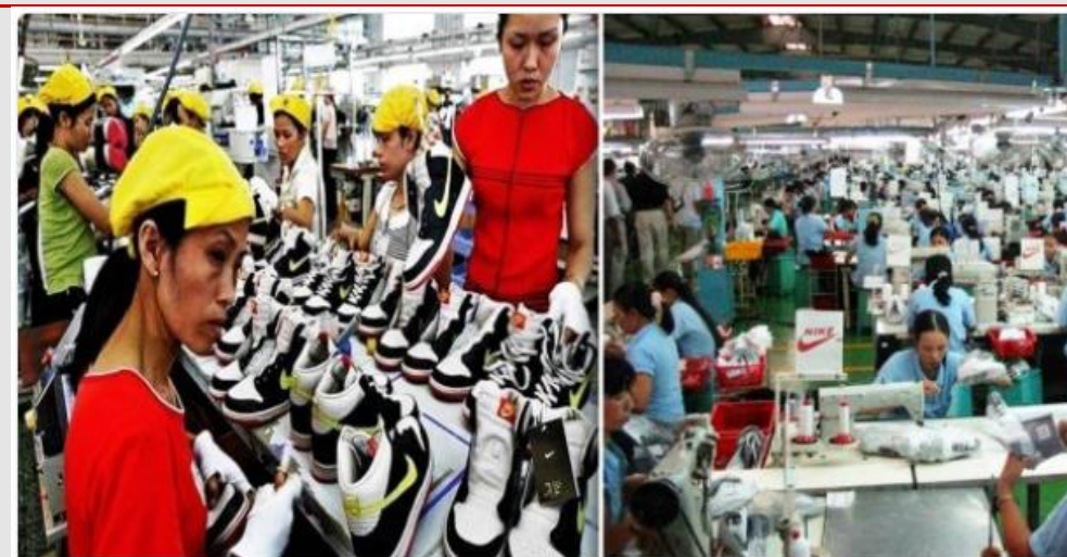
NIKE FACTORY FILTH EXPOSED - Workers Went TWO MONTHS Without Pay, ... The Colin Kaepernick conversation stops here. At this point, I could not care less about the guy. So what if he went to a Super Bowl and turned into a social justice w...

Y = ridiculed purchased political parties x career lobbyists x globalist mainstream media x career unelected Deep State bureaucrats x Hollywood elites x unprosecuted corruption x globalist banking cartels x globalist technocrats x pharmacological reprogramming x gross incompetence x lust for power x love of money x conspicuous consumption x corporate fascism x loss of Good Samaritans x accelerated singularity