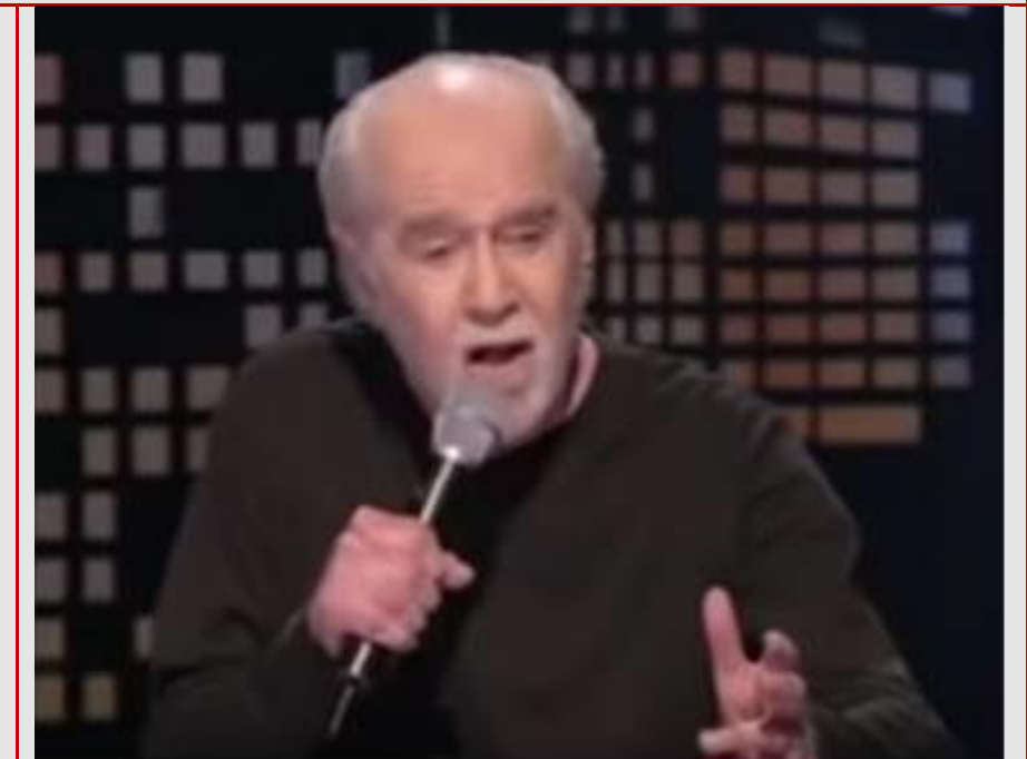
CONSTITUTIONALISM...is the new counterculture.