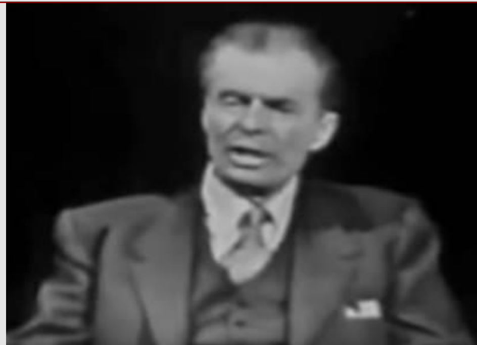
Sent from the New Republic.