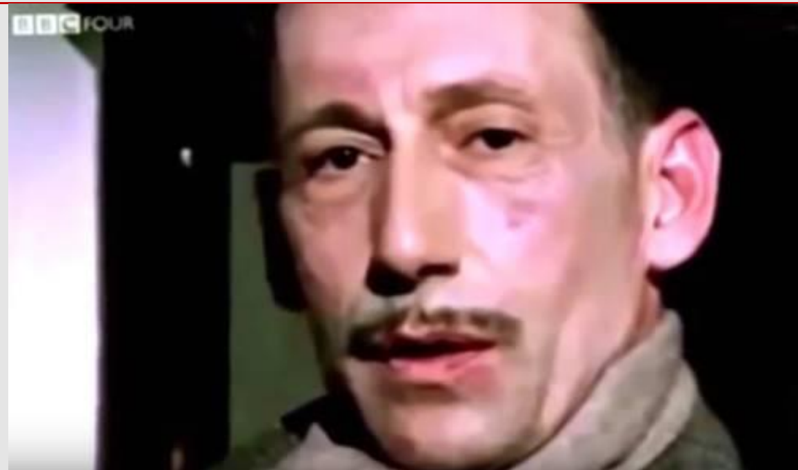
SYNCHRONICITY and ELECTRIC UNIVERSE.

.....starts with one person, one relationship, one family, one neighbor, one neighborhood, one village, one community, one city, one state, one nation, at a time...simultaneously.