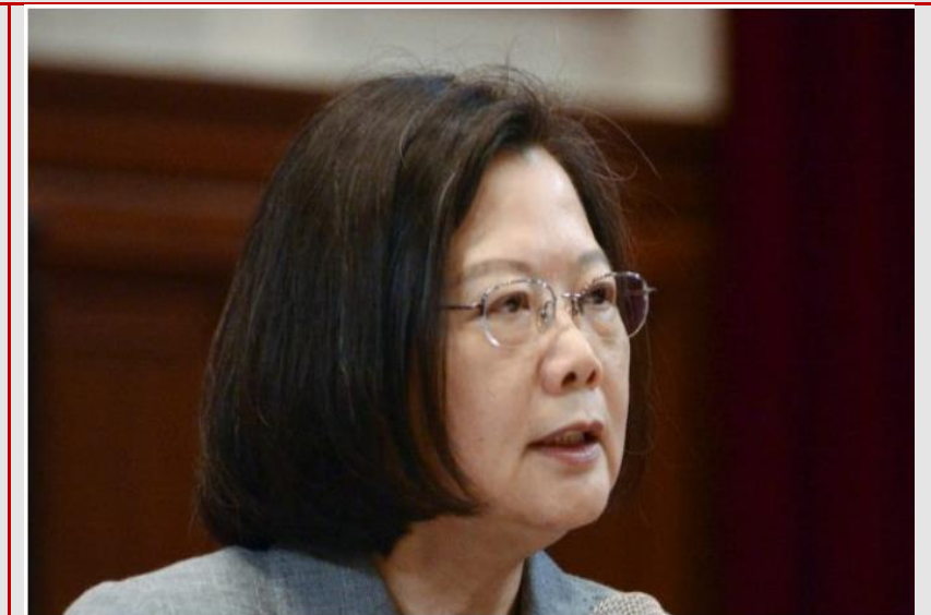
Taiwan's President Tsai Ing-wen speaks during the news conference in Taipei, Taiwan, on Jan. 5, 2019.