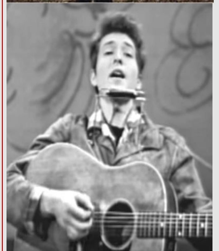
CONSTITUTIONALISM...is the new counterculture.