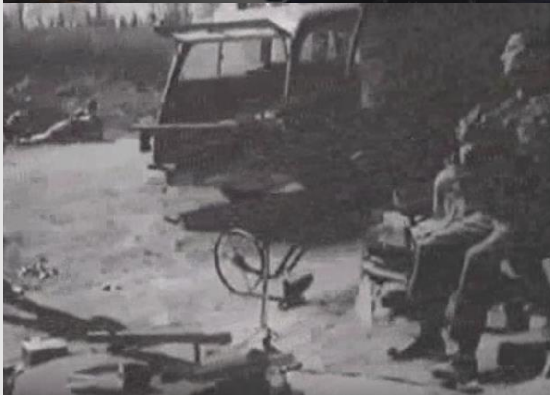
Sent from the New Republic.