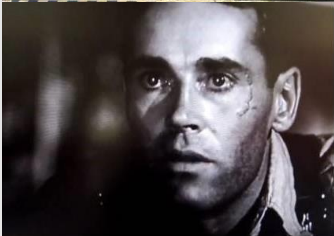
SYNCHRONICITY and ELECTRIC UNIVERSE.