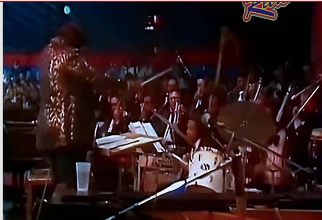
Sent from the New Republic.