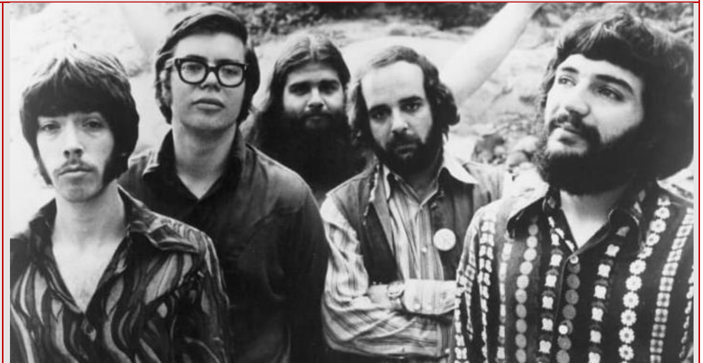
CONSTITUTIONALISM....is the new counterculture.