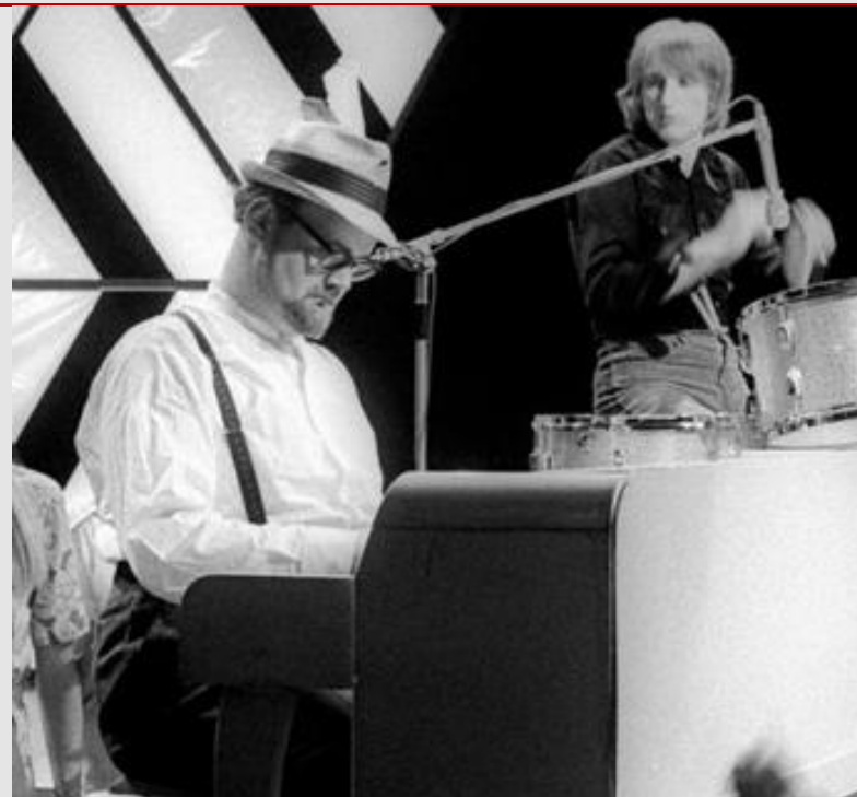
SYNCHRONICITY and ELECTRIC UNIVERSE.

.....starts with one person, one relationship, one family, one neighbor, one neighborhood, one village, one community, one city, one state, one nation, at a time.... simultaneously.