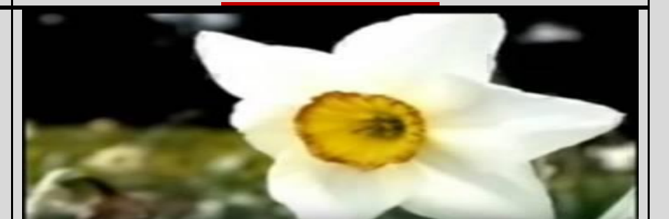
CONSTITUTIONALISM....is the new counterculture.