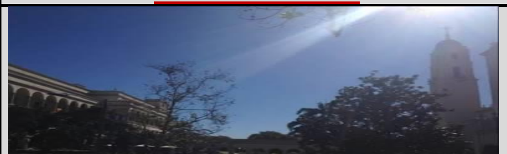
Sent from the New Republic.